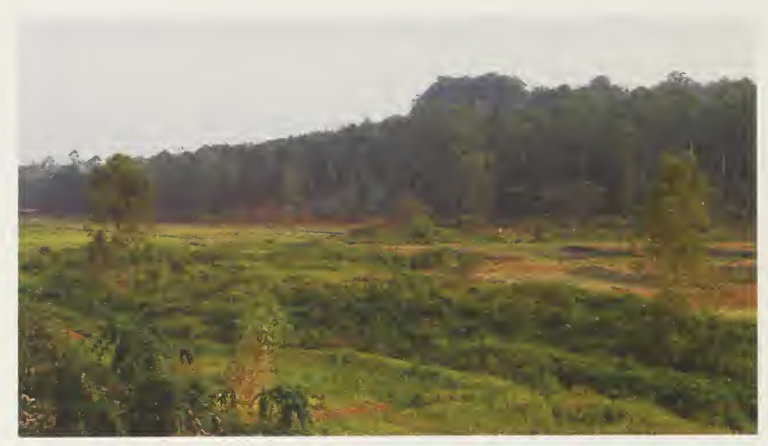
Figure 2. View of the Arboretum of Ruhande and, in the foreground, Rwasave fish ponds (right) and rice fields (left), Huye, Rwanda, July 2015 (B. Boedts)

Vue sur l'arboretum de Ruhande et, en avant-plan, les étangs piscicoles de Rwasave (à droite) et les rizières (à gauche), Huye, Rwanda, juillet 2015 (B. Boedts)